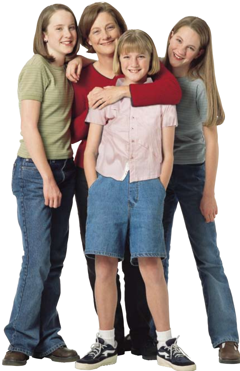
Parents' vs Teens' Perceptions

All Maine teens are at risk for alcohol use. And many teens don't believe their parents will find out if they drink. Maine teens who don't think they'll be caught by their parents are 5 times* as likely to use alcohol as those who think they will get caught.